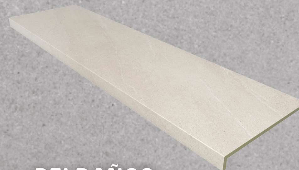
PELDAÑOS STAIR TREAD

* TAMAÑO PELDAÑO: RECTO (120') STAIR TREAD SIZE: STRAIGHT (120')