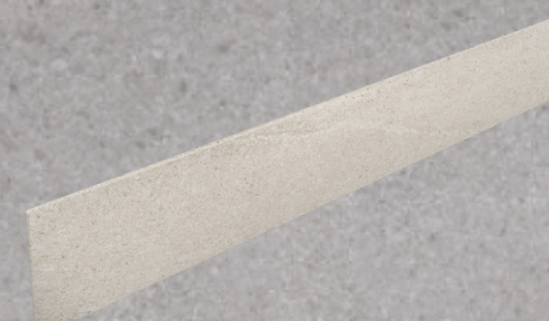
TAPAS PELDAÑOS STEPS COVERS