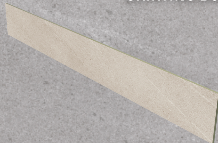
TABICA 15 x 120 RISER 15 x 120