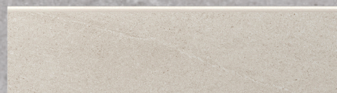
RODAPIÉ 60 SKIRTING BOARD 60